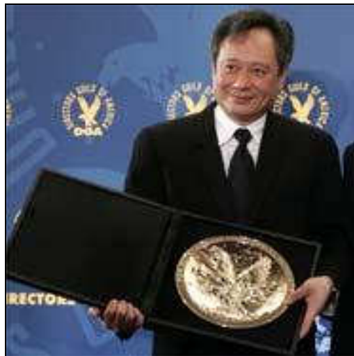
Ang Lee accepts 2005 Screen Directors Guild Award for Outstanding Directorial Achievement in Feature Film

I was certain that the critics, the good critics, would see Brokeback Mountain for what it was. But I did not anticipate that it would be reviewed so broadly. There are many films that are reviewed only by a few critics; the others don't bother. In this case, I was surprised by the number of reviewers that gave it attention. And it happened immediately. I thought it would take longer for the film to receive attention. In fact, I expected that it would be one of those films that developed word-of-mouth recognition, rather than review-driven publicity.