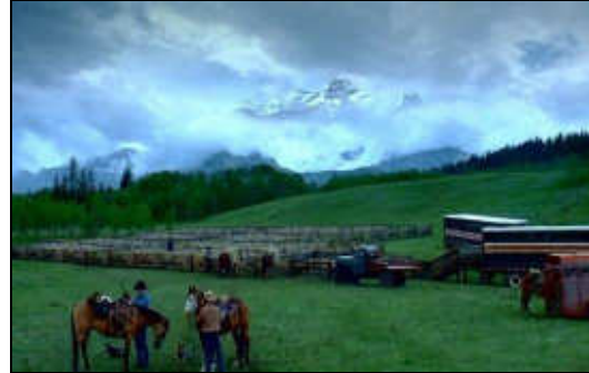
Staging Area plus “Brokeback”