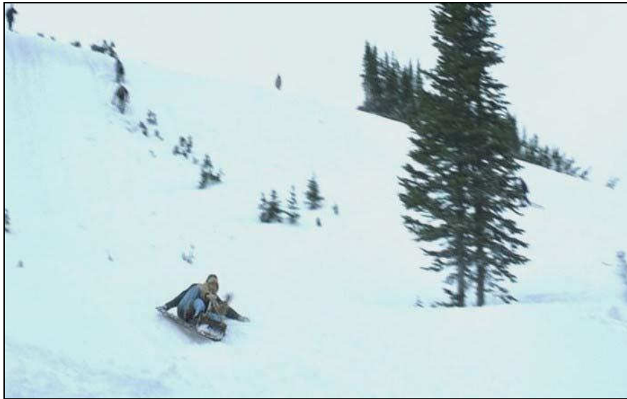
“What about tobogganing?” Toboggan Scene Fortress Ski Area AB