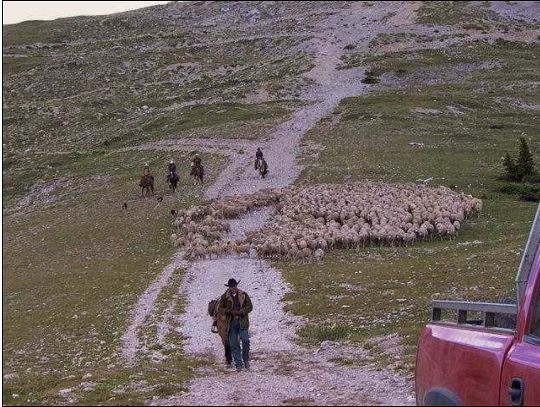
Jake Gyllenhaal Double Moose Mountain AB

So then we had somewhere in the vicinity of 900 sheep to get up there. That was two 18-wheeler tractors full. They had to stop at the bottom of the trail and drive the sheep up in smaller trucks. No one else could do anything while they were doing all of this. Then they had to set up pens near the top of the mountain for the sheep.