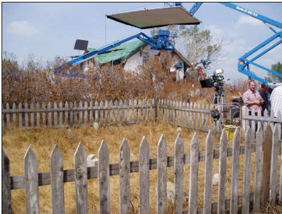
“It had to do with how he wanted to finish the scene.” Twist Cemetery (deleted scene) Beiseker, AB

That’s an Ang Lee question. It had to do with how he wanted to finish the scene, maybe he wanted him to walk away [from the Twists] and not have that final moment.