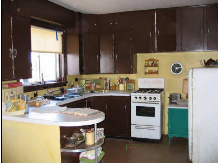
“It was very warm and very cramped.” Laundry Apartment Fort Macleod, AB

This was the first time that Ang Lee had made a film outside of its “real” location. So he was adamant about finding locations that looked and felt “real.” And that was true of the Laundry Apartment. That confined feeling does come across in the film.