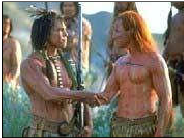
Scene from the 2003 Miniseries DreamKeeper

I have also done a number of TV movies. I did one ABC miniseries, DreamKeeper , as a second assistant director, which aired over the course of two nights in 2003. It was notable for me because it was among the most difficult shows I have ever worked on. We had to tell native stories set all over North America. The logistics were demanding. We had to change tribes, actors, locations; we had different everything—art departments, for example—for each tribe.