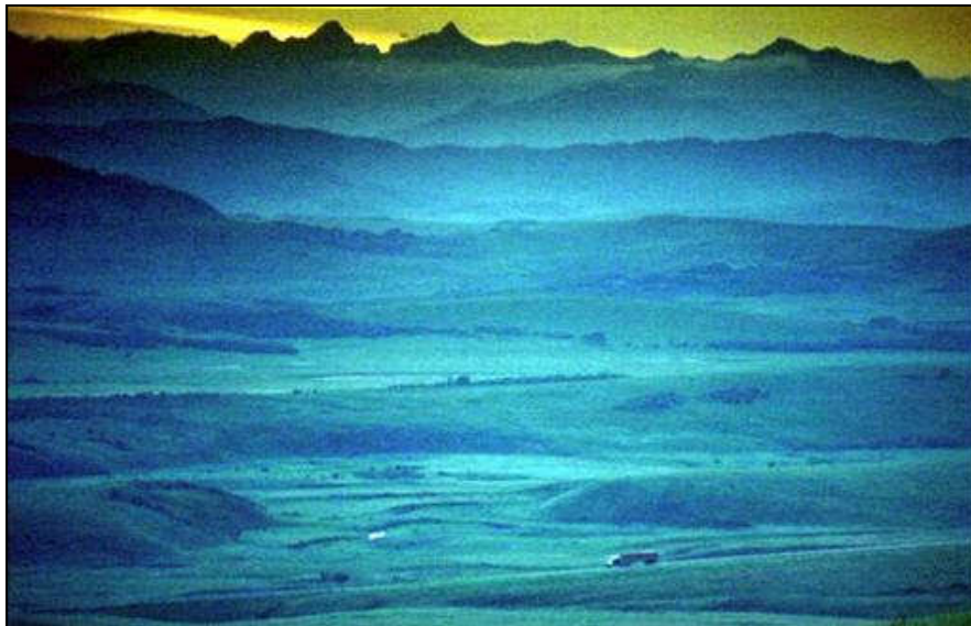
"It was possibly my favorite day on a set, ever." Opening Shot near Longview, AB

It was possibly my favorite day on a set, ever. [Wistfully] We struck out through the mountains, and we had doubles riding on ridges. We did the cattle truck on the highway near the end of that day.