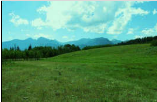
Sheep Staging Area

Ang had specific visual effects requirements dealing with mountains, roads, rivers, vistas—the large shots. Brokeback is not a film of moving cameras. It is a still film. Which means every frame must be perfect. Which also means that sometimes he had to “move mountains.”