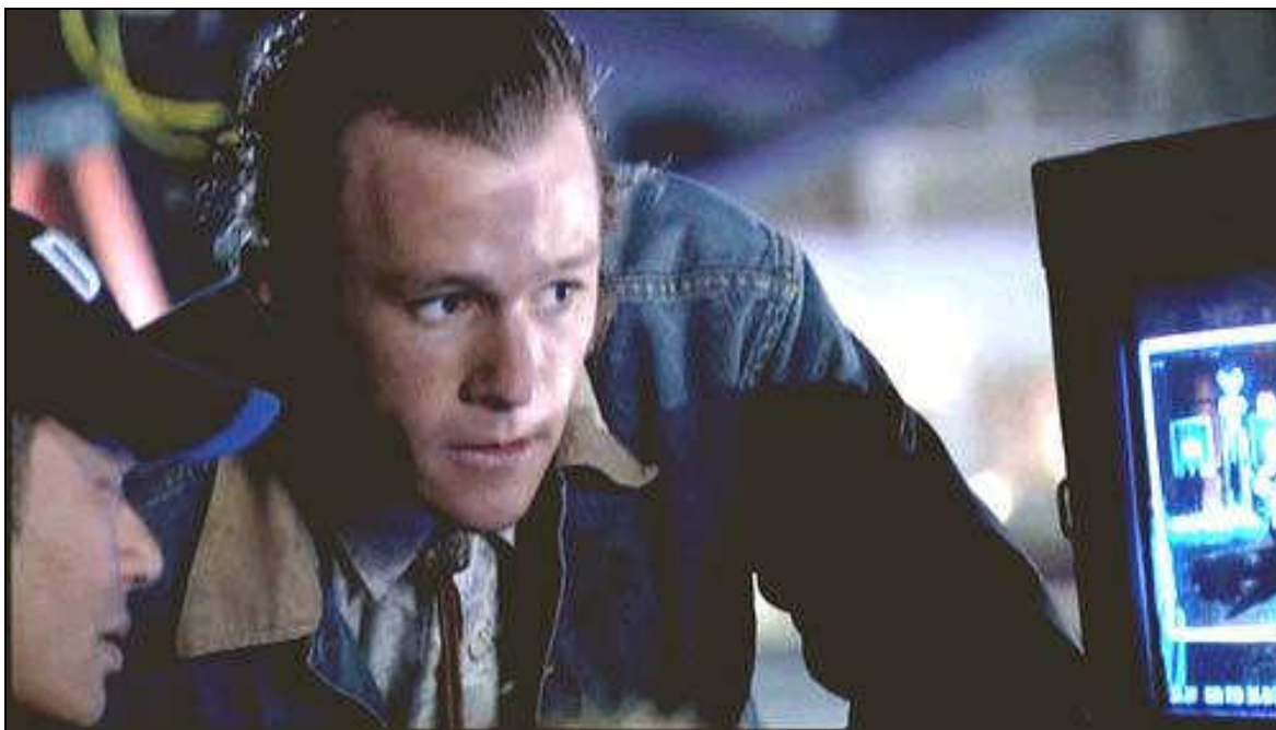
"We did not want it to look like a Hollywood fight." Thanksgiving Fight Bar Blackie, AB