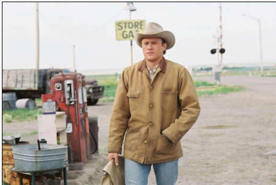
“When you go to these small conservative towns, everybody knows your business.” Signal Gas Station (deleted scene) Carseland, AB

That [Carseland, AB] was a great place to shoot because it was so quiet except for the occasional train that goes by. When you go to these small conservative towns, everybody knows your business, and you are never sure how they are going to react. I was consistently surprised at how accommodating everybody was, even when they knew our story.