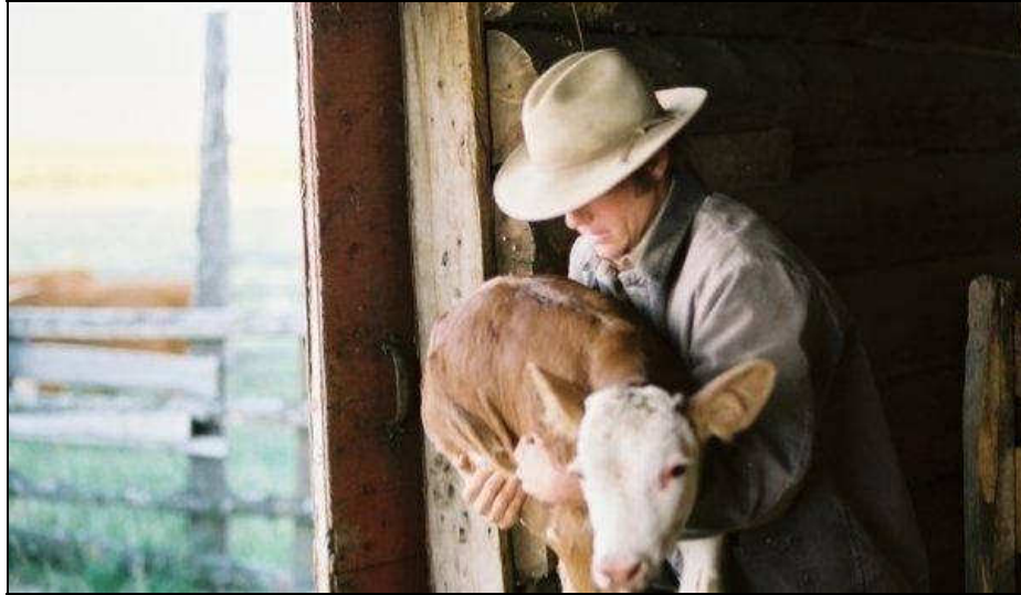
“They did not just spend their lives pining for each other.” Ennis the Vet (deleted scene) near Claresholm, AB

On rare occasions we’ll shoot things which are not explicitly in the script. That scene was, I think I recall, on the “wish list” of things we tried to shoot when we could. I can’t tell you why that did not make it into the film. Ang knows!