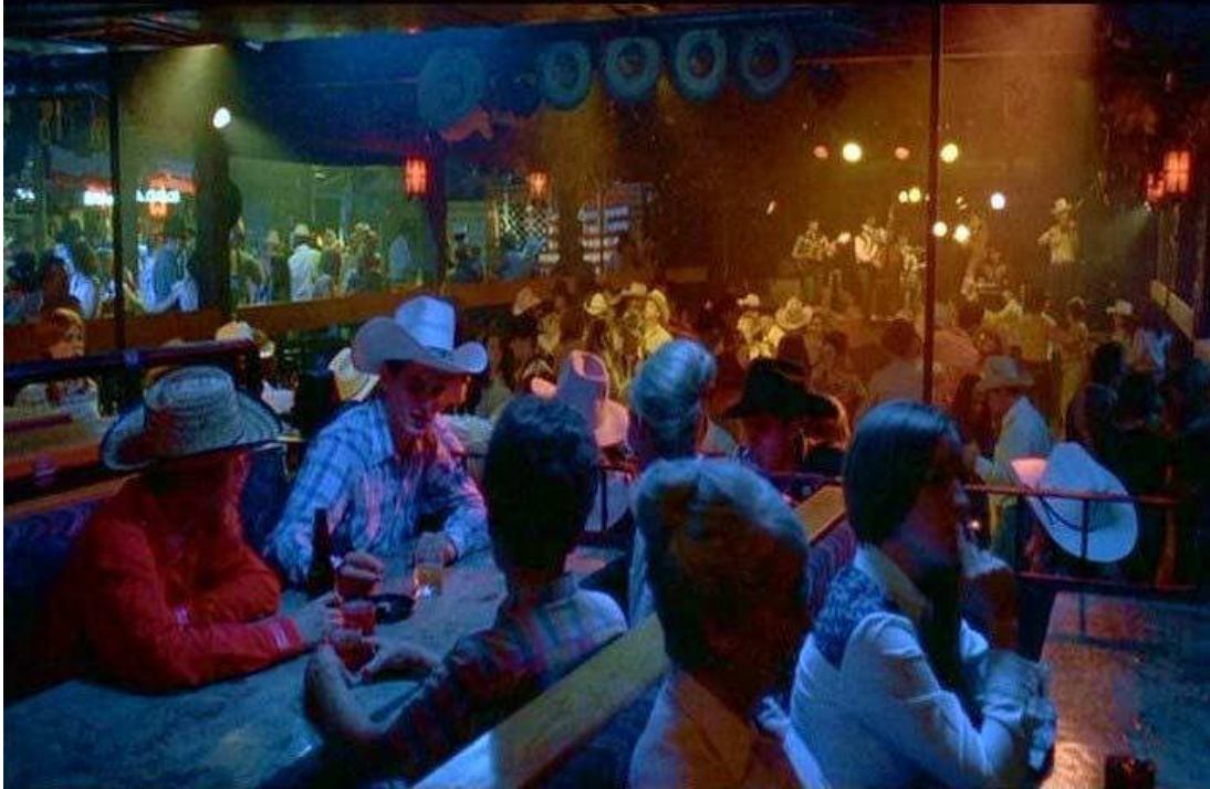
"Most of the people we used in that scene were regulars." Childress Bar Calgary, AB

As a side note, Ranchman's is also where we had our wrap party. It was the best wrap party I have ever been to.