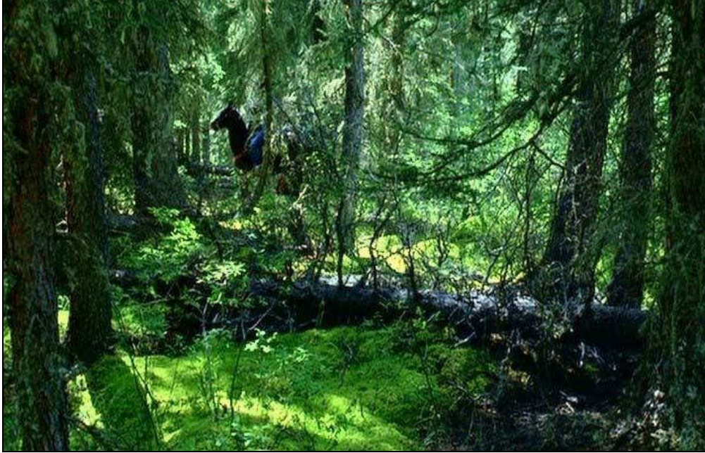
"A magical spot." Mosses Spray Valley Provincial Park AB