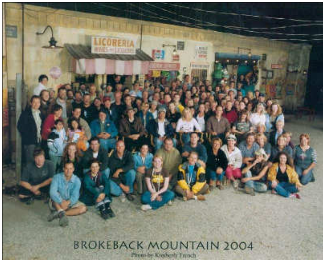
"Hell yes, we've been to Mexico!" Brokeback Cast and Crew Photo Juarez Alley Calgary, AB

of meetings: truck meetings, art meetings, stunt meetings, special effects meetings, meetings within every department. Oftentimes more than one department is involved.