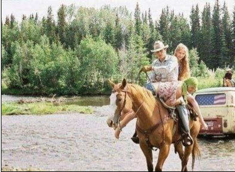
“So many things... can go wrong and throw your plans out the window.” Hippie Rescue (deleted scene) Jumping Pound Creek AB

This was one of those things that took longer than we thought it was going to. The weather was not great, the river was high, getting that VW bus in the river and getting it ‘stuck’ so that we still could pull it out, getting the horses in the water—there were lots of little things we had to arrange to make the scene work. And of course, whenever you put a vehicle in water there are strict environmental rules; you have to make sure there is no oil or gas in it. That can be a big pain in itself.