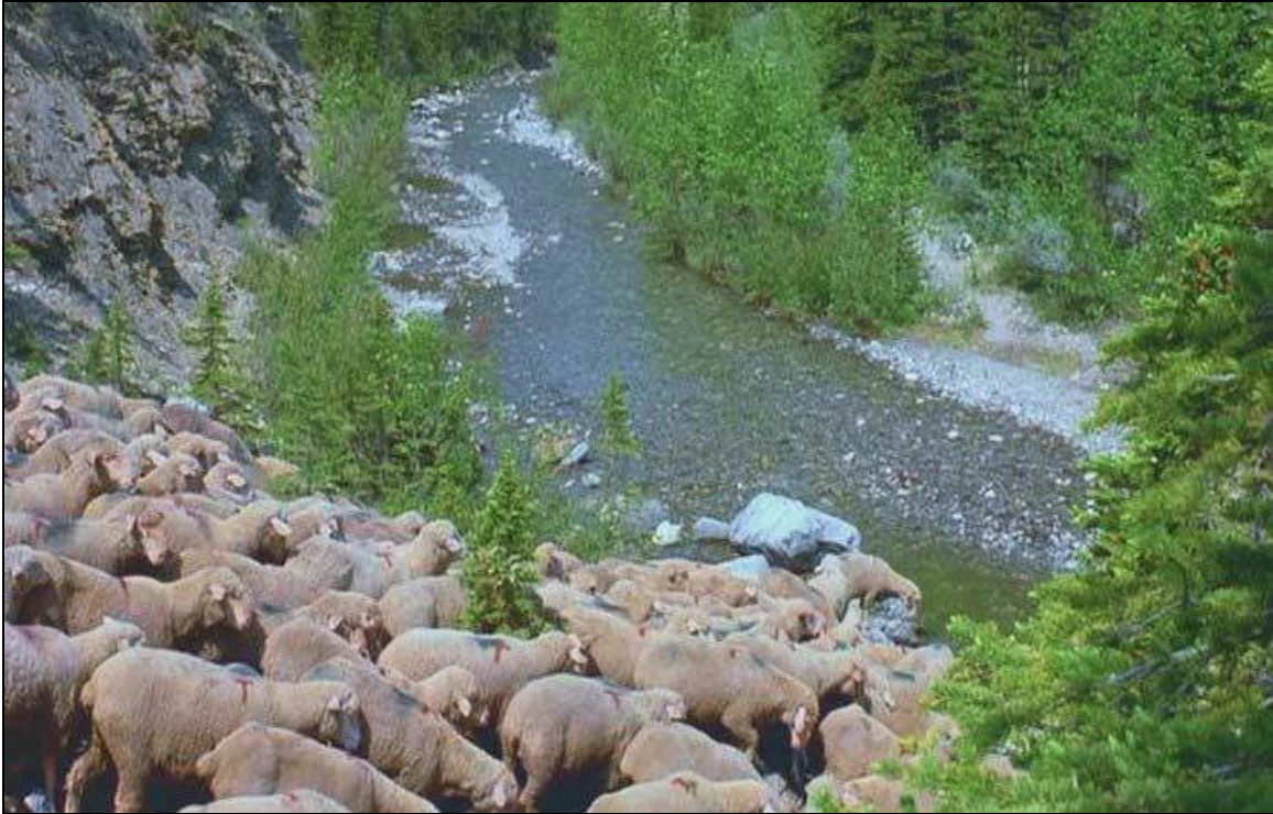
"Sheep are not crazy about running water, let me tell you that." Creek Crossing Canyon Creek, AB