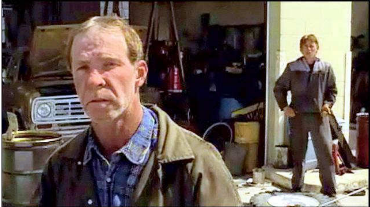
"Lee did that expressly...so that there would be questioning." Sneering Mechanics (deleted scene) Calgary, AB

It was a way of making it less explicit, and leaving the story much more open to interpretation. I'm sure that was a big debate, a huge choice. It was a tiny thing, but a very important piece of the picture that he purposely left out.