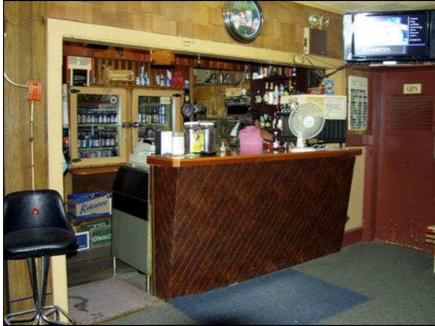
“Canadian bars are not set up that way.” Signal Bar Carseland, AB