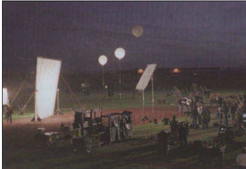
"I love this scene, but it was painful to shoot." Fireworks Area Fort Macleod, AB

We had a fight sequence and a huge lighting setup. And then there were the fireworks! Also, it is usually very windy there. You have to be extremely careful in windy areas when you are working with fireworks. So there was a big question mark right up to the time that scene was shot as to whether it would be calm enough for us to shoot fireworks.