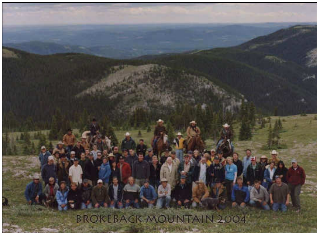
"This may be the peak. And if that proves to be the case, I accept that." Brokeback Cast and Crew Photo Moose Mountain AB

This may be the peak. And if that proves to be the case, I accept that, because Brokeback Mountain will be very difficult to top. Not just because of the material, although it is a rare thing when you have the opportunity to work on a film that is so important, of such quality, a great story, and with a team of gifted professionals.