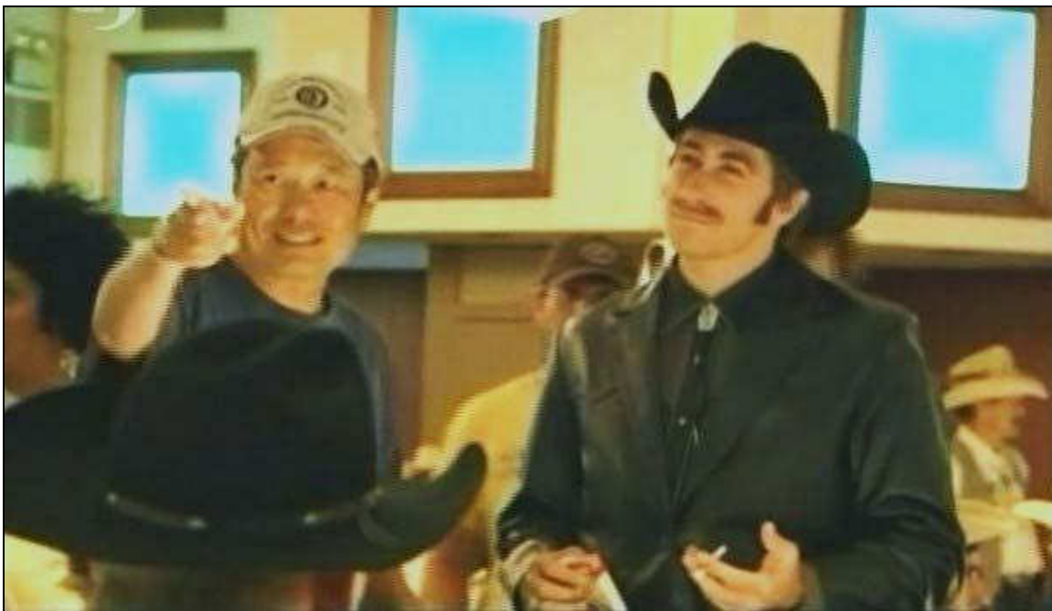
"Ang Lee was really very firm about what he wanted." Childress Dance Hall Calgary, AB