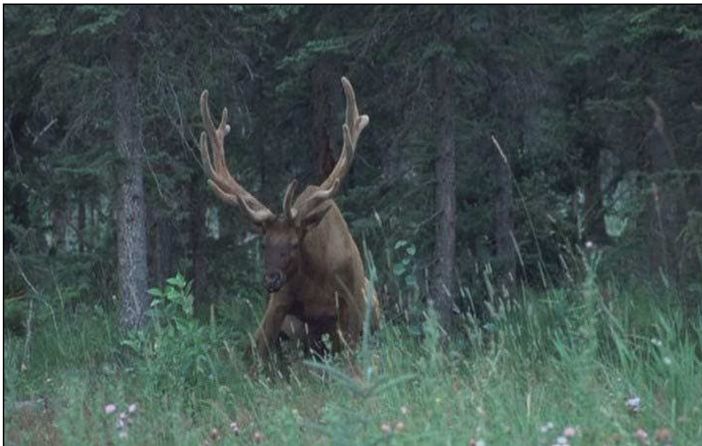
"That was tricky." The Elk Jarrett Elk Farm Caroline, AB

That was tricky; we had to hit an elk and get it to fall down the right way. That is incredibly difficult, since they are wild animals. We did that several times.