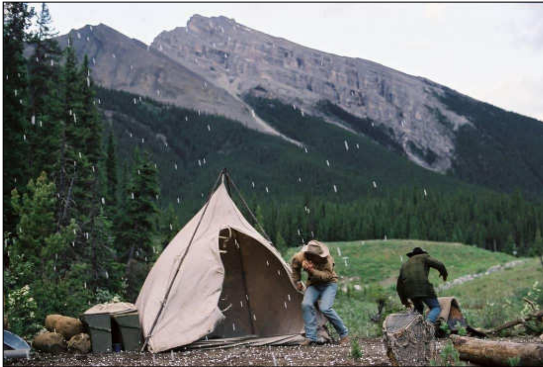
“There are various levels of effects.” Hailstorm at Campsite #2 Spray Valley Provincial Park AB

Once the film has been edited, the director goes through and says, “I want to change the sky in this shot and the lighting in that shot,” and the visual effects people endeavor to achieve that. Where an image, such as a sky, is required, the director goes through the library material and picks out what he wants. Hopefully, it is there. Sometimes it is not, and you have to send somebody out to get a still photo. The final production ends up looking smooth, but the process is not always smooth!