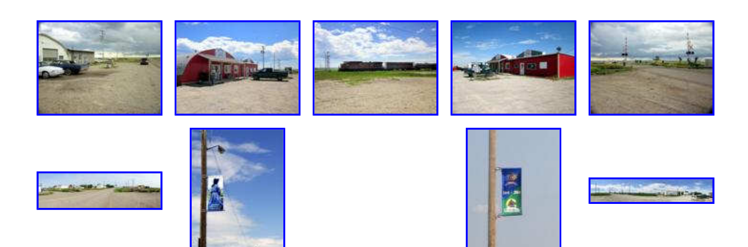
Revised 26 November 2014