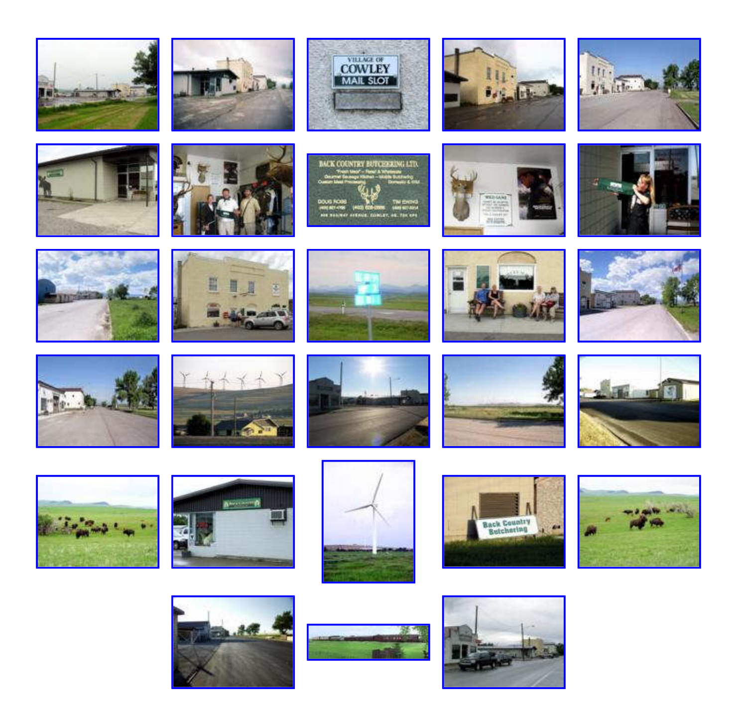
Revised 17 December 2012